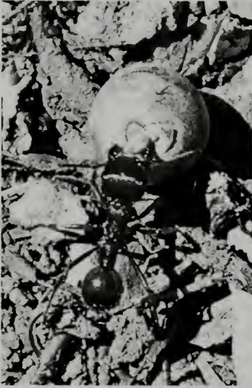
Figure 4. Harvester ant carrying a juniper fruit to its nest/ mound.